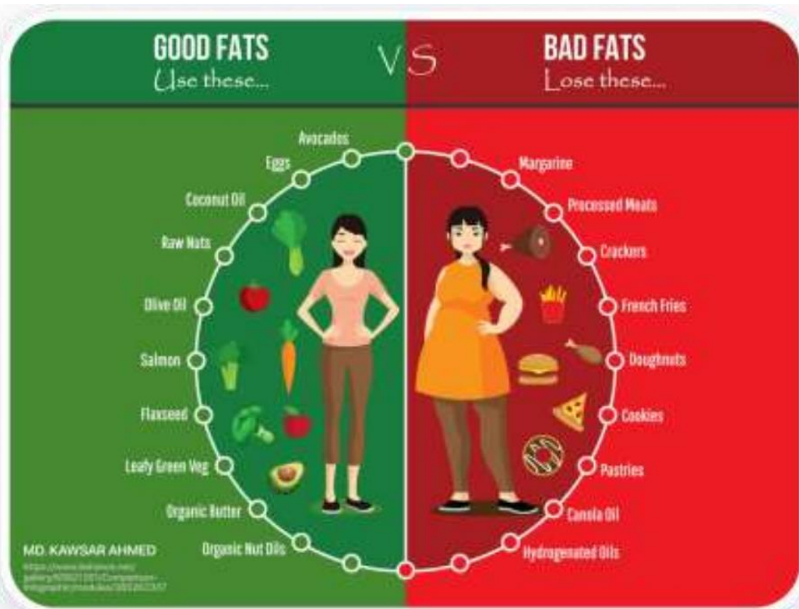
Infographic about the composition of useful and harmful fats for the human body

If this type of infographic is intended to show similarities and differences, to lead the viewer to a solution or conclusion, then it is better to end it with a conclusion.